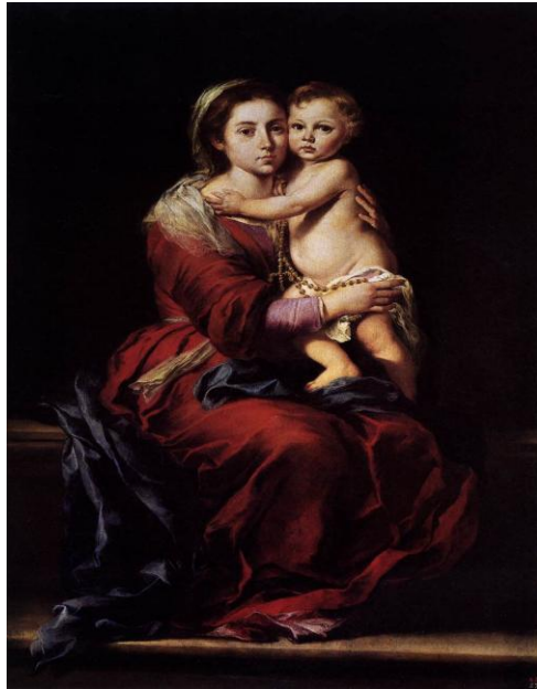
Virgin with a Rosary (Museo del Prado, Madrid)/ Oil on canvas/ c. 1950-55/ Murillo

(Picture Prayer) Now go to the picture of the mother and her children taking the baby back to the church. Think of your own faith journey, your own walk with Jesus, and how Christ has led you closer to His Father through the eyes and wisdom of your children.