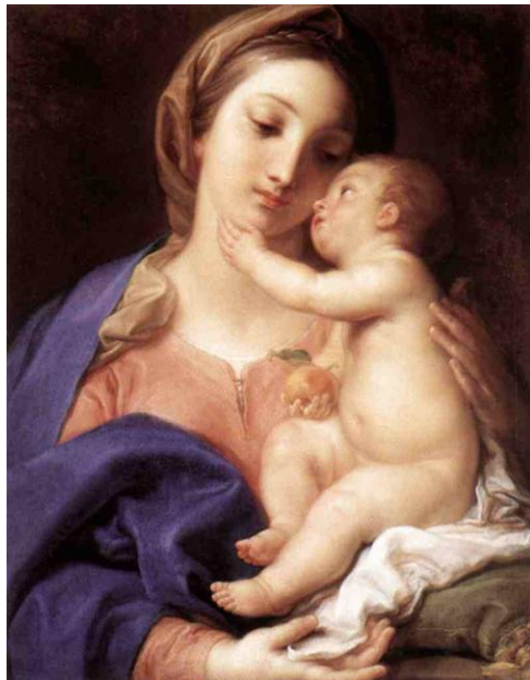
Madonna and Child (Galleria Borghese, Rome)/ Oil on canvas/ c. 1742/ Pompeo Batoni